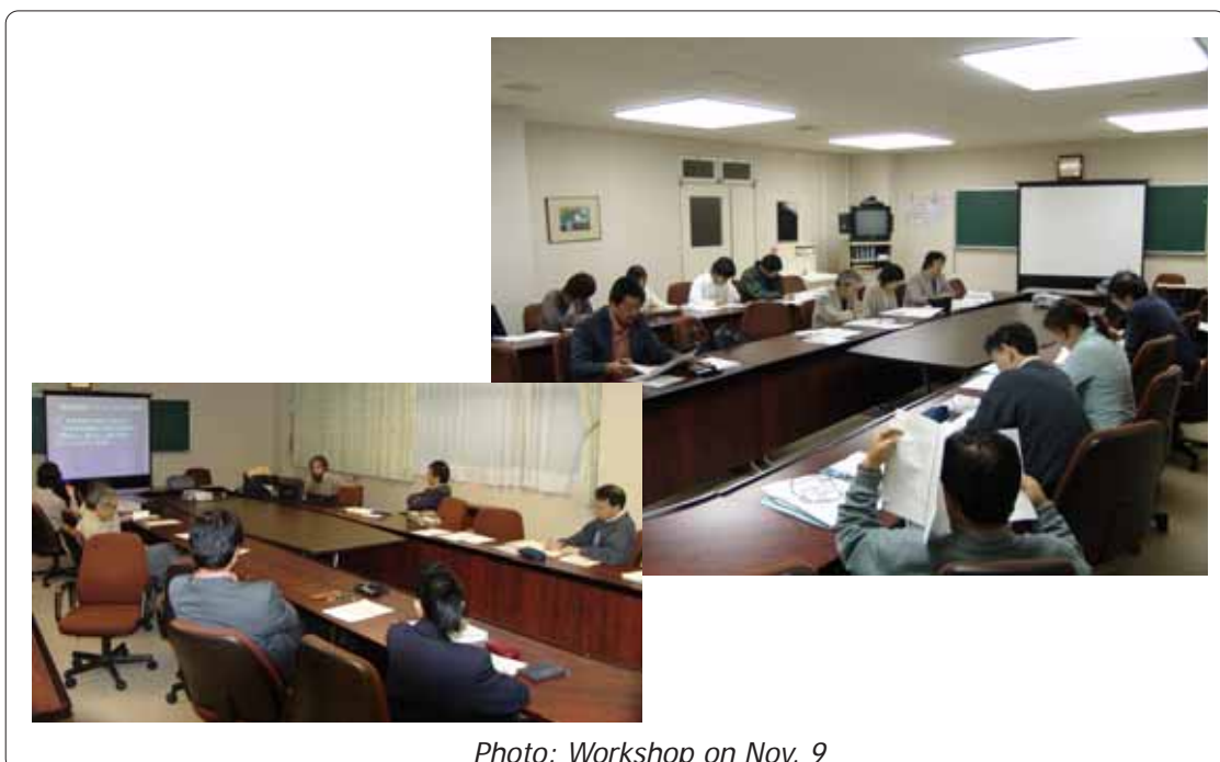
Photo: Workshop on Nov. 9